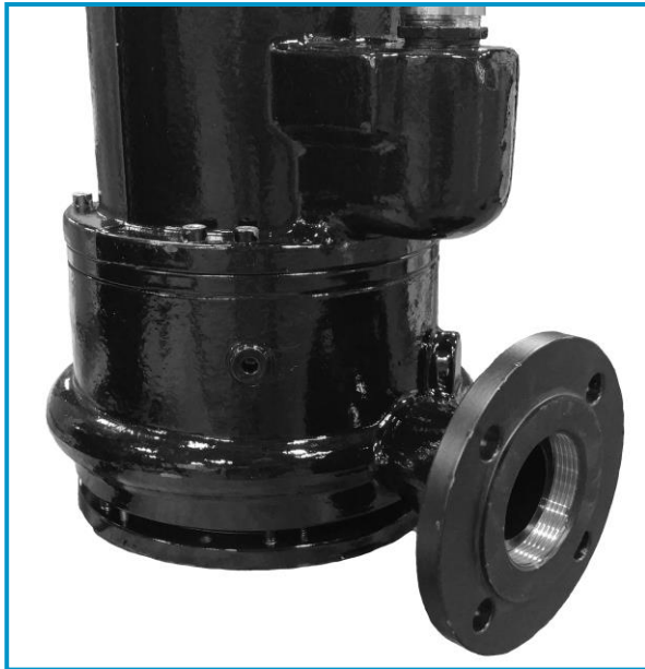
↗ KSB 2" Flanged Adapter