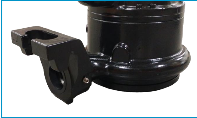
◀ Xylem (Flygt) 2" Threaded Adapter With Profile Seal