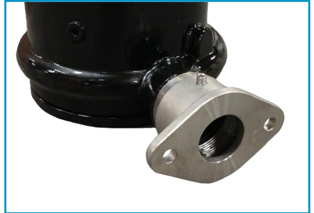
↗ ABS Piranha Adapter (Also Compatible with 1 1/4" Liberty Pump flange)