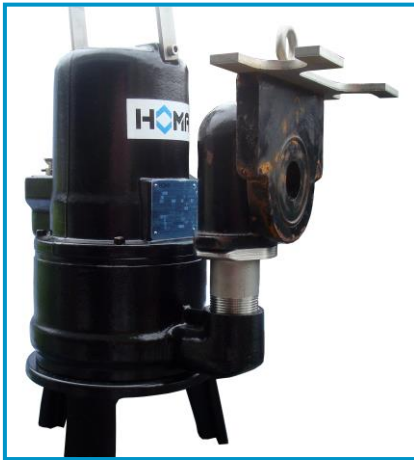
Myers SRA-125 Adapter