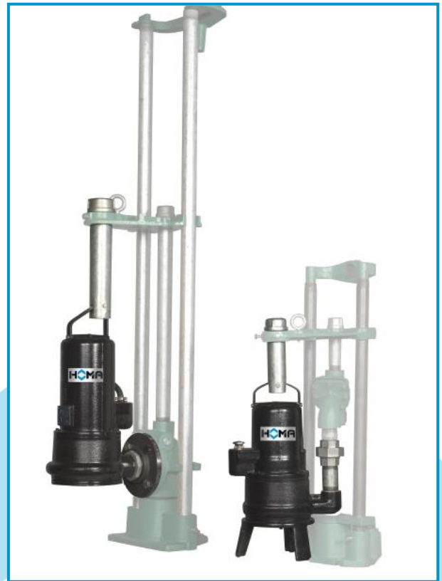
Myers 2 1/2" Flanged Adapter and 1 1/4" Threaded Adapter