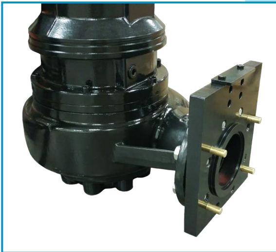
Fairbanks Morse 4" Adapter