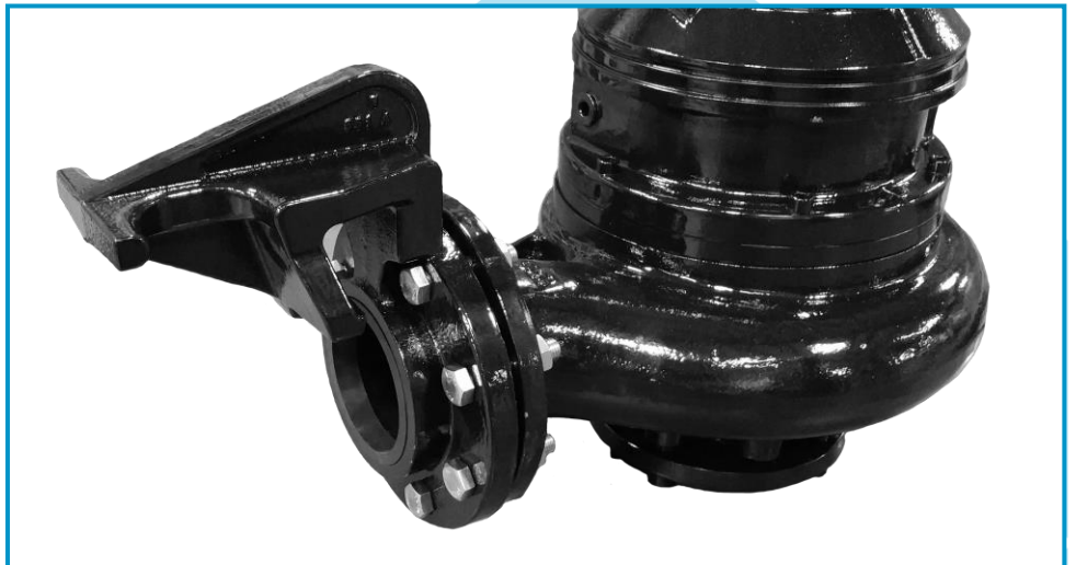
Xylem (Flygt) 4" Flanged Adapter with Profile Seal ▶