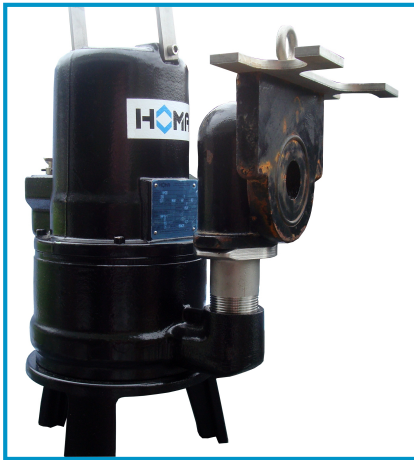
Myers SRA-125 Adapter