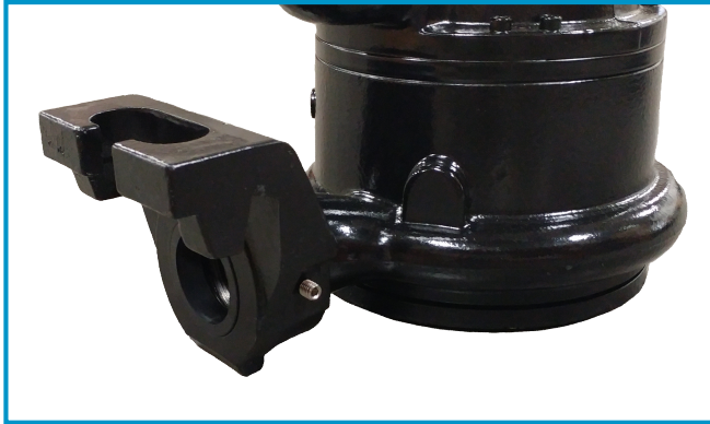
◀ Xylem (Flygt) 2" Threaded Adapter With Profile Seal